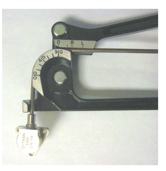
Continue to bend as needed for installation.